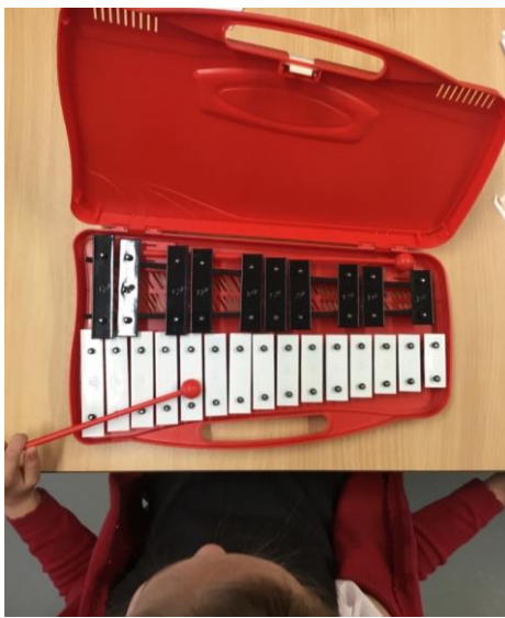
This is a D note