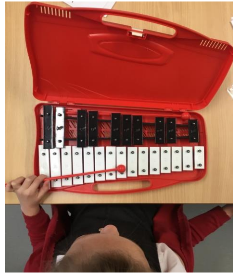
This is a G note