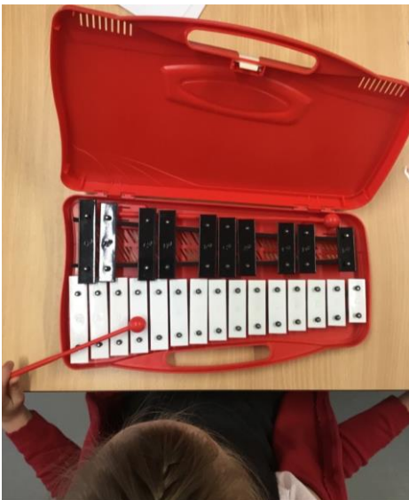
This is a C note