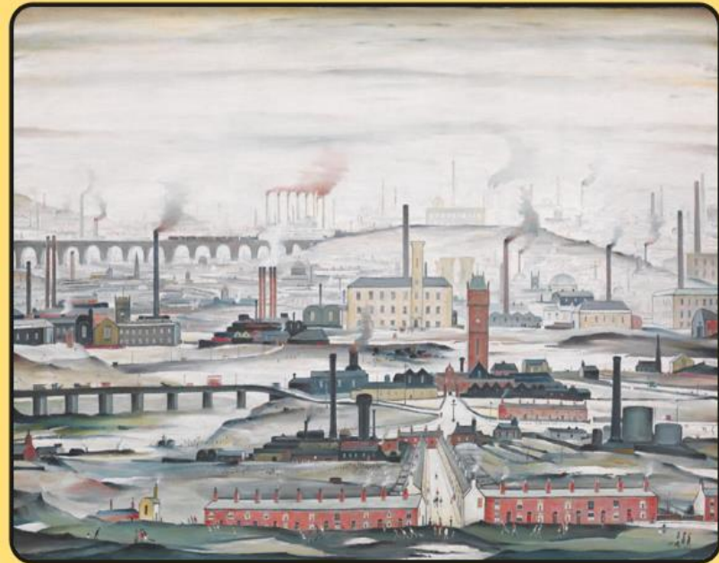
Industrial Landscape, 1955 by LS Lowry

Lowry painted lots of industrial landscapes , as this was what he saw around him as he went about his daily life.