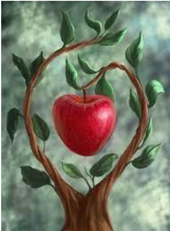
The temptation of Adam and Eve in the Garden of Eden

the desire to do something, especially something wrong or unwise .