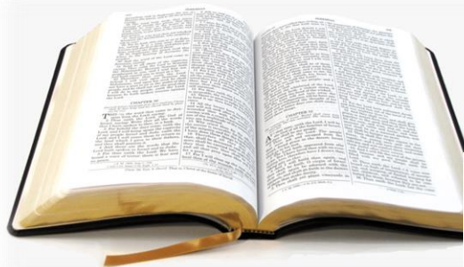
Christians read the Bible