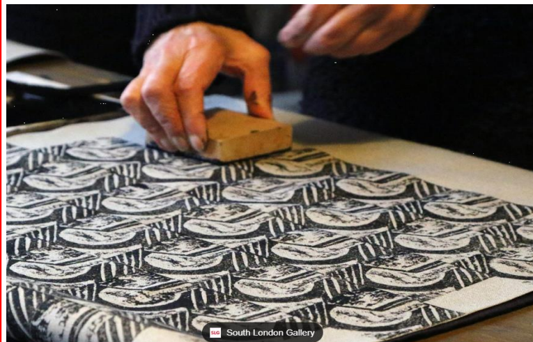
South London Gallery